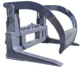
Pipe and Log handler