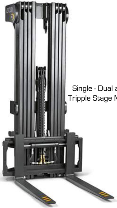
Single - Dual and Tripple Stage Mast