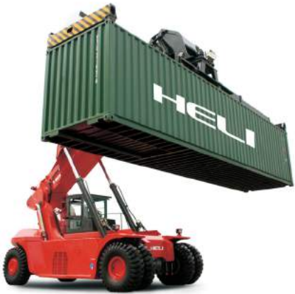
HELI Container Handlers