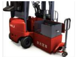
Battery Side Pull Multiple Shifts