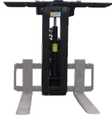
Load Stablizer for Beverage Industry