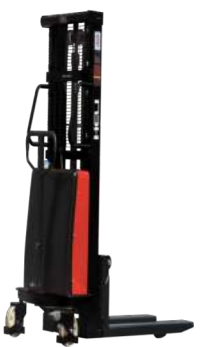
Semi Electric Stackers