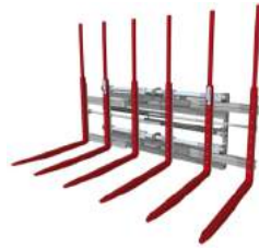
Multiple pallet handler