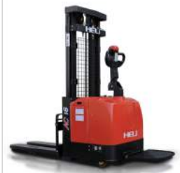
High Efficiency Electric Stackers 2.5 tons