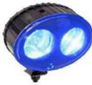
Blue and Red Safety Light