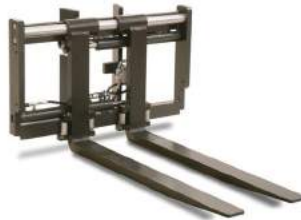
Pallet Side Shifting