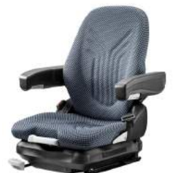
Specialized & Customized Seats