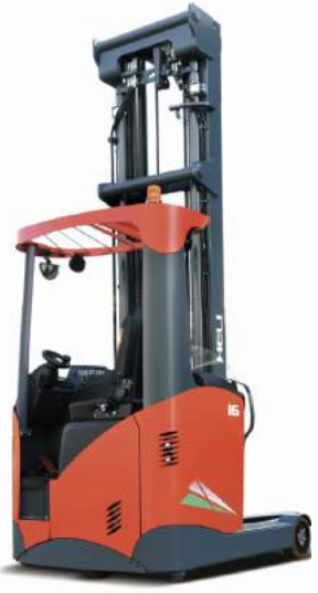
New Reach Truck 1-6-2 tons upto 12.5 Meters