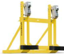
1 - 2 - 3 - 4 Drum handler