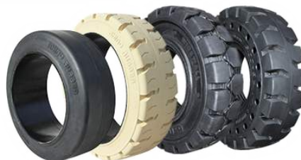
Standard - Solid - No Mark Tires