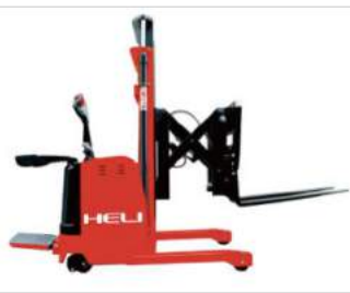
Double Deep Power Pallets and Stackers