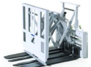
Push and Pull Slip Sheet Attachment