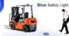
Blue Safety Light