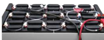
Optional Single Point Filling System Battery AUTO Water Filling System