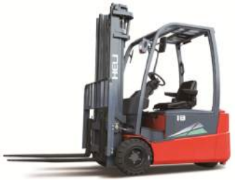
3 Wheel Electric Forklift 1.5Tons to 2 Tons