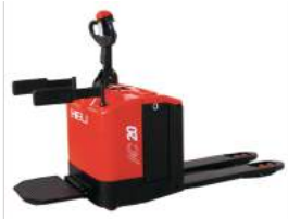
High Efficiency Power Pallets upto 3.5tons