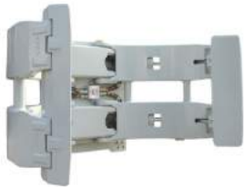
Paper Roll Clamp