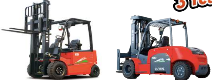
4 Wheel Electric Forklift 1.5Tons - 10 Tons